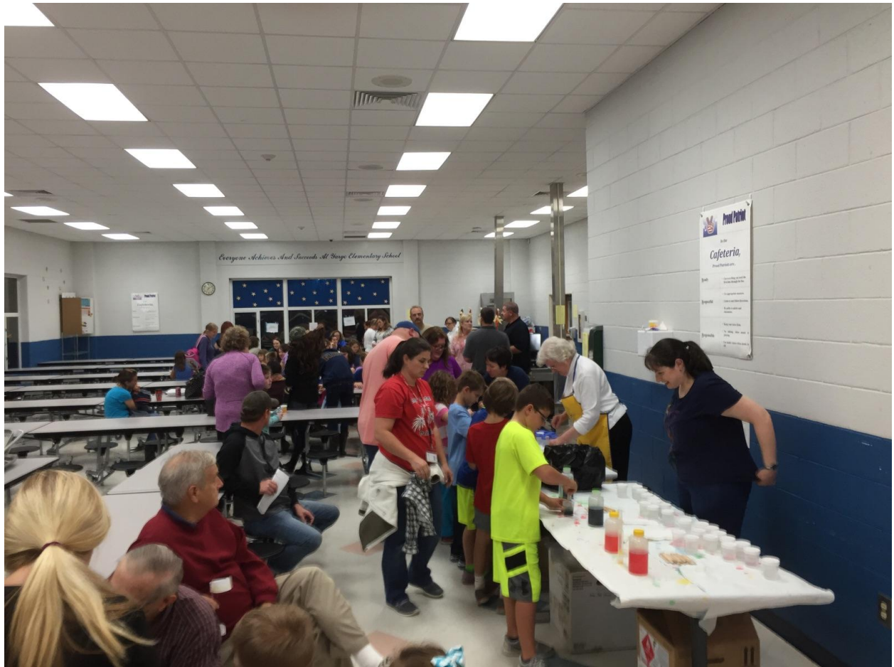
Choose your favorite color as long as its red, blue, green or yellow.